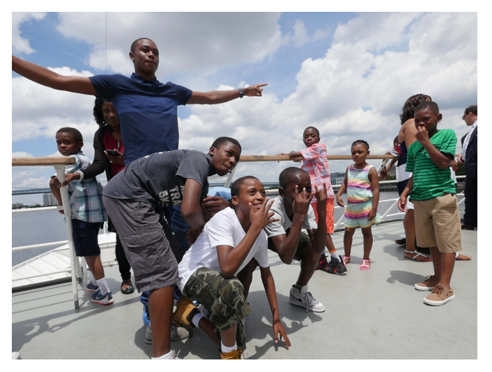
Norris Summer Camp field trip on The Spirit of Philadelphia.

Will become a key part of ongoing documentation of the community that will continue past the life of the grant.