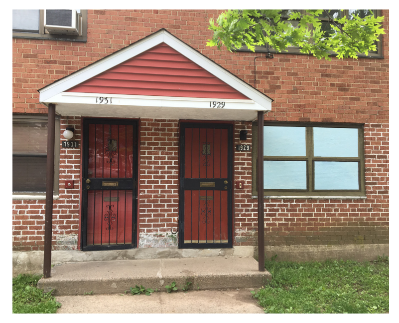
Door and windows repainted over plywood. 1929 N. Warnock Street.