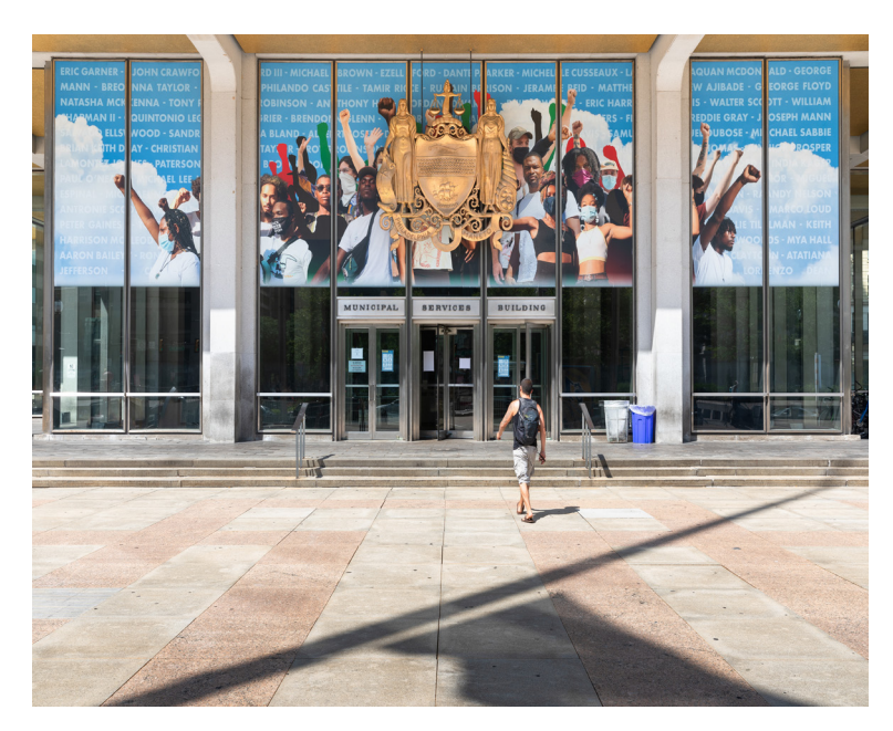
Crown © 2020 Mural Arts Philadelphia / Russell Craig, Municipal Services Building, 1401 JFK Boulevard.