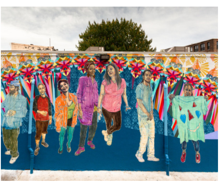
Healing Begins Through Connection © 2018 Mural Arts Philadelphia / Swoon. 2913 Kensington Avenue.