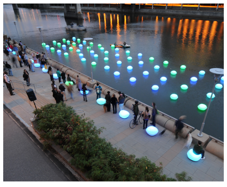
Light Drift © 2010 J. Meejin Yoon. Schuylkill River between Market and Chestnut Streets.