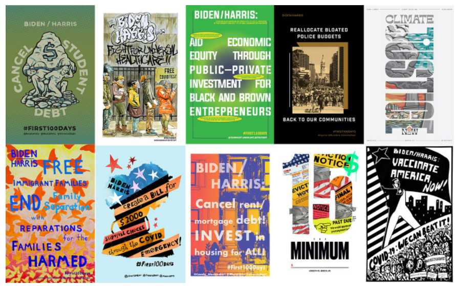
First 100 Days posters.